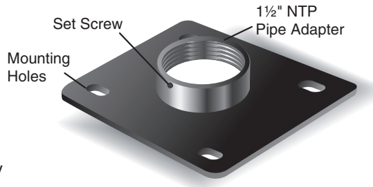
Figure 1. FCMP 44 Features

The FCMP 44 (Flat Ceiling Mount Plate) is a simple and easily installed mounting solution for hanging a projector in installations where a short extension pole is used or where larger mounting plates cannot be installed. The FCMP 44 can support a projector setup weighing up to 200 lbs (91.6 kg), and is suitable for installation on wooden joists. It has an integral 1½" National Pipe Thread pipe adapter, allowing the attachment of a suitable projector pole, such as one of the Extron PMP (Projector Mounting Pole) series. The FCMP 44 is a complementary mounting accessory for use with the Extron UPB 25 (Universal Projector Mount Bracket).